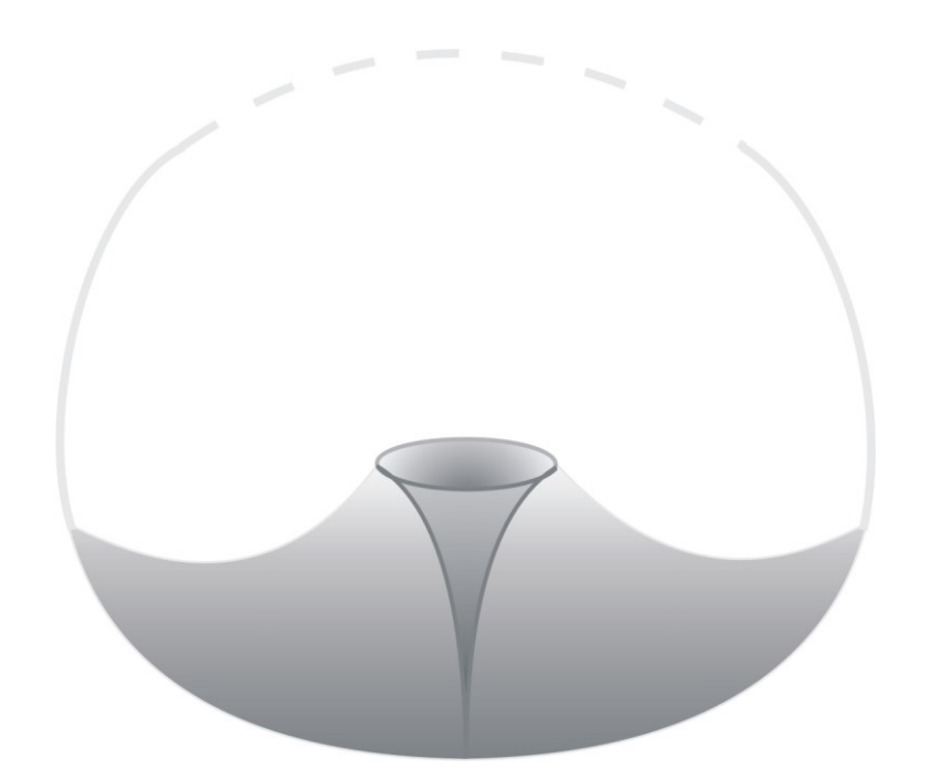
The edge of the crater symbolizes the most visible circumscription, while the existent halo falls off outwards and conceals the imaginary background. Inside, the circumscribed whole condenses until it reaches the infinitesimal center of the funnel, which in the depths of the increasingly enfolded collapses with the absolute universal continuum. The latter envelops the point of observation as "vision".