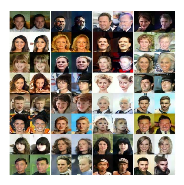
Figure 3. Reconstructed images with generated images

The above figure shows the data generated by the generator of the trained GAN.