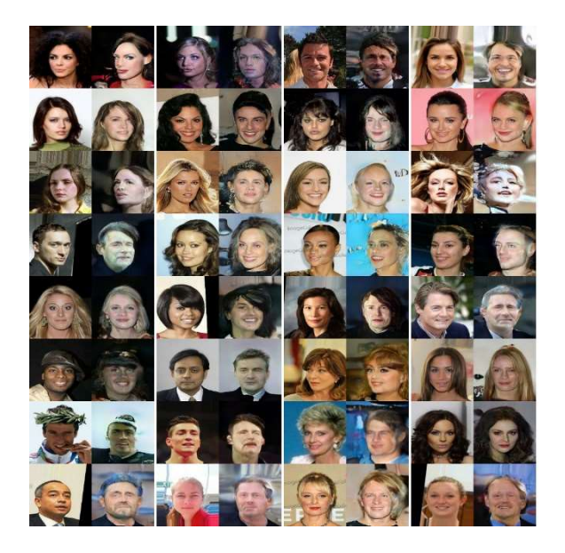
Figure 4. Reconstructed images with real (test) images

images show the generated images, and the right images show the reconstructed images. One can see that the generated images are almost completely reconstructed.