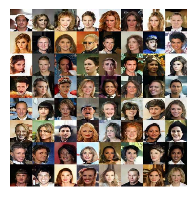
Figure 2. Generated images

The above figure shows the data generated by the generator of the trained GAN.