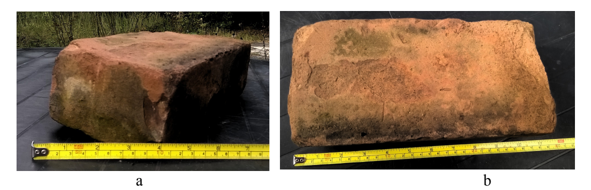
Fig. 1. Non-contact measurement of brick.a) The brick seems to be approximately a square (3" x 3,5").b) The edge which seems shorter (3") actually is longest (12").

In reality there are many possibilities that what we see or measure is just an illusion. Above all it applies to non-contact distant measurements which are used in the SRT. For example, the result of brick length measurement depends on the angle between the brick surface and tape measure (Fig. 1.).