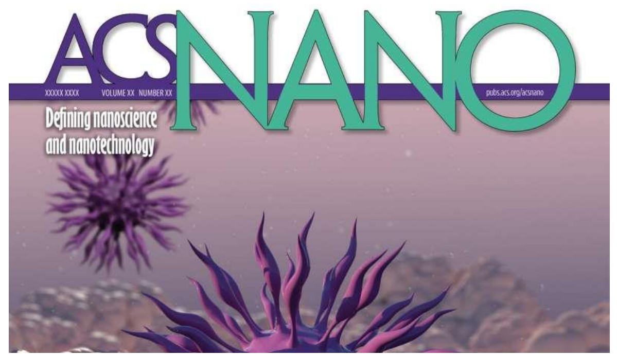
OSU researchers Olena and Oleh Taratula's work with magnetic nanoclusters as cancer therapy was featured on the cover of ACS Nano.

Olena Taratula and Oleh Taratula of the OSU College of Pharmacy tackled the problem by developing nanoclusters, multiatom collections of nanoparticles, with enhanced heating efficiency. The nanoclusters are hexagon-shaped iron oxide nanoparticles doped with cobalt and manganese and loaded into biodegradable nanocarriers.