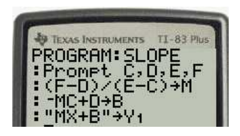
Figure 1: Code for linear regression using two points.