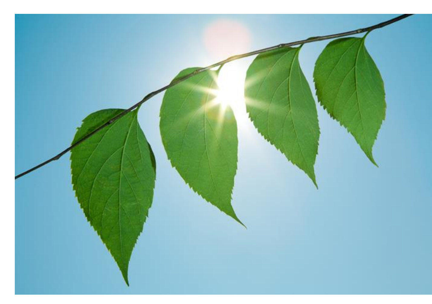
Quantized vibrations are essential to photosynthesis, say physicists