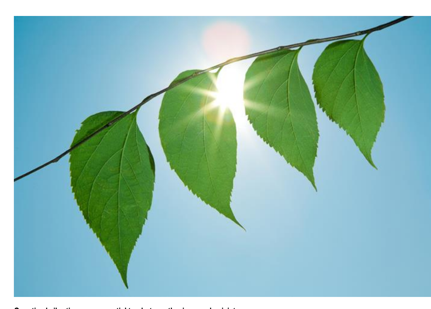
Quantized vibrations are essential to photosynthesis, say physicists

qubit's energy levels amounts to about 0.001 eV, whereas a typical laptop battery stores a few 10^{24} \text{ eV} . "These devices will not replace normal batteries," he says.