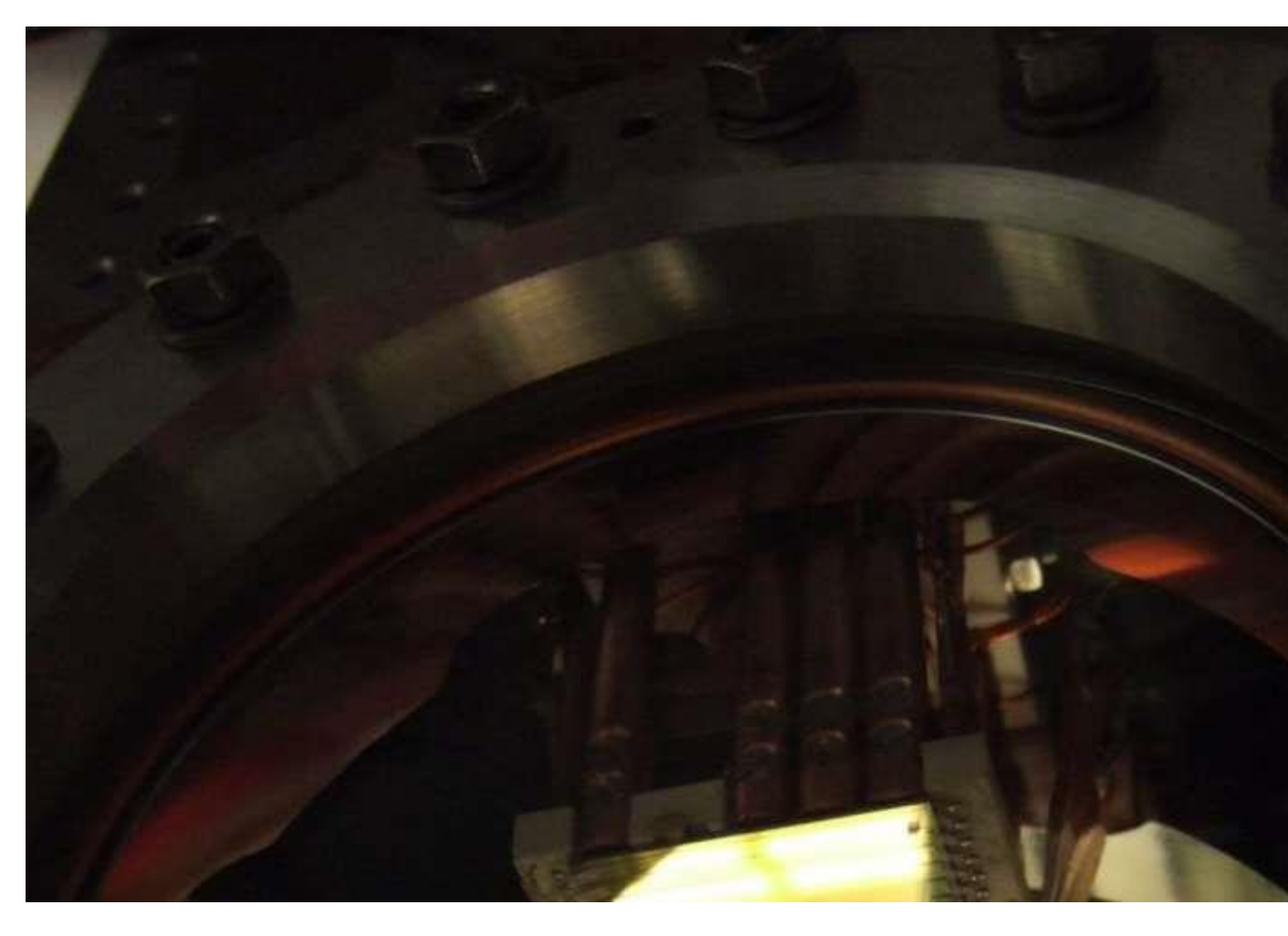
The atom chip, used to control ultra cold atom clouds.

There have been attempts to demonstrate the effect of "Poincaré <u>recurrence</u>" in quantum systems, but until now this has only been possible with a very small number of particles, whose state was measured as precisely as possible. This is extremely complicated and the time it takes the system to return to its original state increases dramatically with the number of particles. Jörg Schmiedmayers team at TU Wien, however, chose a different approach: "We are not so much interested in the complete inner state of the system, which cannot be measured anyway," says Bernhard Rauer, first author of the publication. "Instead we want to ask: which quantities can we observe, that tell us something interesting about the system as a whole? And are there times at which these collective quantities return to their initial value?"