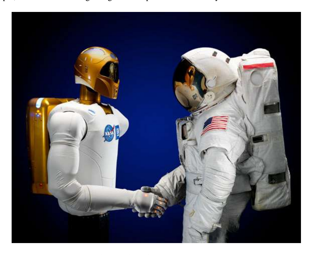
Fig.1. Robot of NASA as austronavt.

attendants of religious cults can only tell that the God is an omnipotent reasonable being. Actions attributed earlier to God as, for example, a thunder, a lightning, creation of the world, the person and many others as it is established by a science, are simply natural phenomena, submit to the certain physical laws and some of them, as for example, the thunder and a lightning can be reproduced artificially.