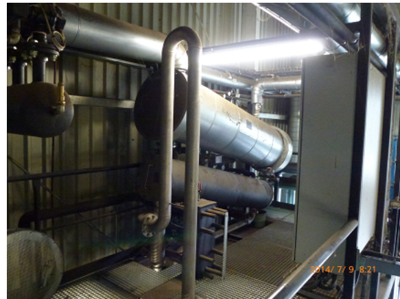
Fig. 2 and part of Urbas wood gas cogenerator on German tourist island of Mainau in the Lake of Constance, Summer 2014.