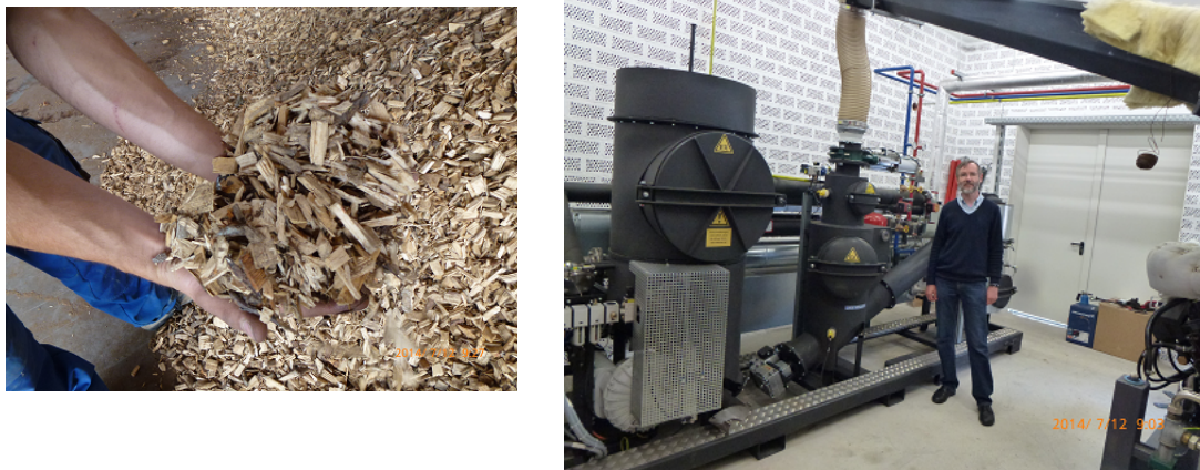
Fig. 4. Spanner Re 2 wood gas cogenerator installed by Josef Strobl Heizung Solar in Giglberg and Velden/Vils/Lower Bavaria/Germany. Left: suitable wood chips. Right: modern 100% wood to gas pyrolysis unit.

right) and heat are used by local residents, who are connected to a small local district heating network. Wood chips (Fig. 4 left) are delivered periodically by truck, and the gas engines are maintained periodically, exactly like engines of commercial vehicles. The expected life time of these wood gas cogenerators is over 20 years.