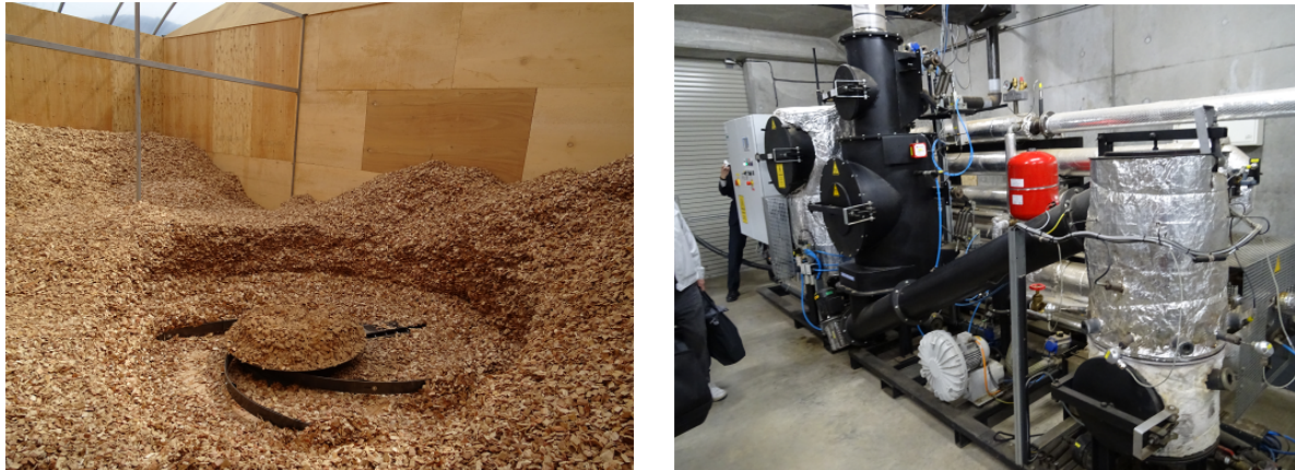
Fig. 7. Wood gas co-generator of Spanner K.K. installed 2014 in Ecomura near Koriyama, Fukushima Prefecture, Japan. Left: automatic feed-in of wood chips. Right: Spanner Re 2 pyrolysis unit (wood to gas).

Spanner Re 2 has set up in 2014 a branch company in Tokyo, Japan, named Spanner K.K. [Spanner K.K. 2014] Spanner K.K. imported in 2014 the first Spanner Re 2 manufactured wood gas cogenerator (Fig. 7 right) to Ecomura in the mountains near Koriyama, Fukushima, where it has cogenerated electricity and heat since October 2014. It soon became the frequent target of curious visitors, who want to learn about this new commercial technology, operating for the first time in Japan. The fuel is locally produced wood chips. We were able to visit this machine and see it in operation in March 2015. This experience taught us how important it is to secure wood chips of sufficient dryness (less than 13% fuel moisture, Fig. 7 left) for the effortless smooth operation of a wood gas cogenerator. (Excess moisture in the wood chip fuel means some of the cogeneration heat will be used for completely drying the fuel. [Spanner Re 3-fach 2015][Volter Oy 2015])