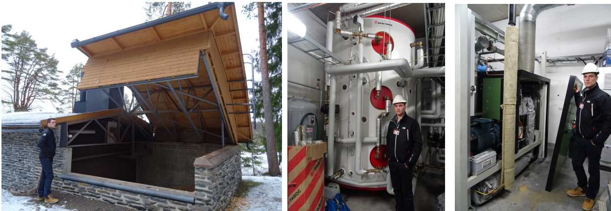
Fig. 8: Volter Oy wood gas cogenerator facilities near Kempele/Oulu/Finland. Left: hydraulic roof wood chip fuel storage. Center: warm water tank. Right: compact wood gas cogenerator. Supplying 32 residential units (see above layout drawing) with total floor space of 2365 m 2 [Liikkujantie 19 2015].

The fuel supply can also be designed very practical and compact. One example is like a personal garage with a hydraulic roof (Fig. 8 left), that can be opened remotely, a wood chip truck moves in front of it, dumps its load of wood chips, and the roof is closed again remotely, thus providing supply for several weeks.