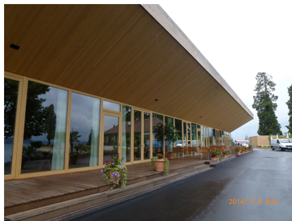
Fig. 3. Mainau Island Restaurants space heating/warm water by Wood Gas Cogeneration.

Next, we toured one of the first wood gas cogenerators set up by the Lower Bavarian (German: Niederbayern) Company Spanner Re 2 on a cooperative farm in Herdwangen, in the southern Black Forest region. The farmers faithfully and enthusiastically operated this machine for over seven years and continue to experiment with inserting a variety of forest residues, even including loads of pine needles. The Spanner Re 2 type of wood gas cogenerator is technically advanced, so that pyrolysis under the right automatically controlled thermal and chemical conditions completely turns any tar into useful wood gas. The only residue is a few percentage points of pure high quality carbon ash, used as fertilizer on organic fields. The wood gas cogenerator has an overall efficiency of 90% of turning the wood's chemical energy into electricity (approx. 1/3) and heat (approx. 2/3). [Heggelbach 2015] [Spanner Re 2015] [Ecolifelab 2014]