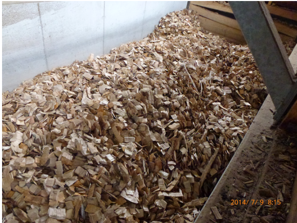
Fig. 1. Wood chips on Mainau Island.

But how does it work? What happens in this wood gas cogenerator? Dry wood chips enter through a double door (to remove air) into an over 1000 °C hot pyrolysis chamber from above. Automatic process control ensures that the wood molecules are thermally cracked completely into gas molecules, with a fine ash content of 1-2%. The fine dry pure carbon ash is automatically removed by textile filters, dropping into the ash removal pipe. The clean pure gas is cooled down with water for combustion in an off the shelf high quality, long life diesel (non turbo) engine, attached to an electric generator, rated 35, 40 or 45 kW. The removed heat corresponds to another appr. 100kW thermal power.