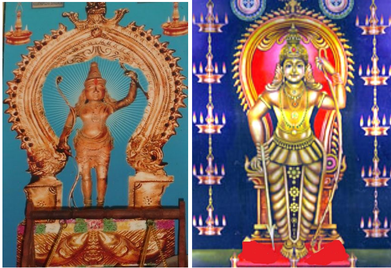
Lord Shaasta in Kulathupuzha and Erumeli, Kerala

Among the 8 key incarnations of Lord Shaasta, the representations of Aiyanaar and Manikantan coincide best with the Kiraatha or Veera Shaasta, often shown standing tall, armed with bow and arrows. This is the form one finds enshrined in most Shaasta temples in Kerala, including Kulathupuzha and Erumeli, two of the six temples of the six Chakras.