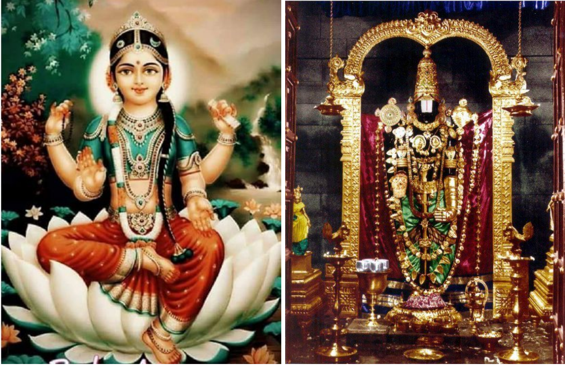
Baalaa Tripura Sundari, Lord Venkatesha of Tirumala

The Lord Srinivaasa, enshrined as the Kali Yuga Varadha Lord Venkateshwara of Thirumala and called Balaji is none other than the Baalaa Herself. In fact, one finds a lot of similarities between Baalaa of Sri Vidya and the Balaji Srinivaasa, the most important among them being the Varadha-Kati Mudra combination of the lower hands, also seen in the shrines of Kanyakumari Bhagavathi and Thiruvaiyaru Dharmasamvardhani. Other important similarities are the Sri Yantra present under the Hundi of Tirupati, Abhishekham to the Lord with turmeric water on fridays, Brhamotsavam of Tirupati coinciding with Navaraatri and the Simha Lalaatam or the lion emblem. One also finds in Thrukodikaval Trikoteeshwara Temple, the shrine where the Mother Tripurasundari, aptly named “Kaatchi Koduttha Ambaal” gave Darshan to the Alvars as Lord Venkatesha of Tirupathi, complete with Shankha, Chakra and Kati Hasta.