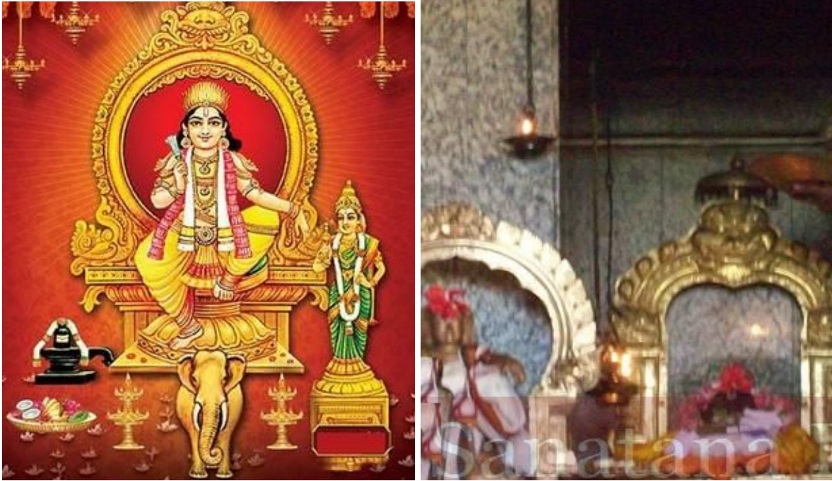
Lord Shaasta in Aryankavu, Kerala and Trayambakapuram, Tamilnadu

staff. These features correspond closest with the Maha Shaasta among 8 incarnations of the Lord.