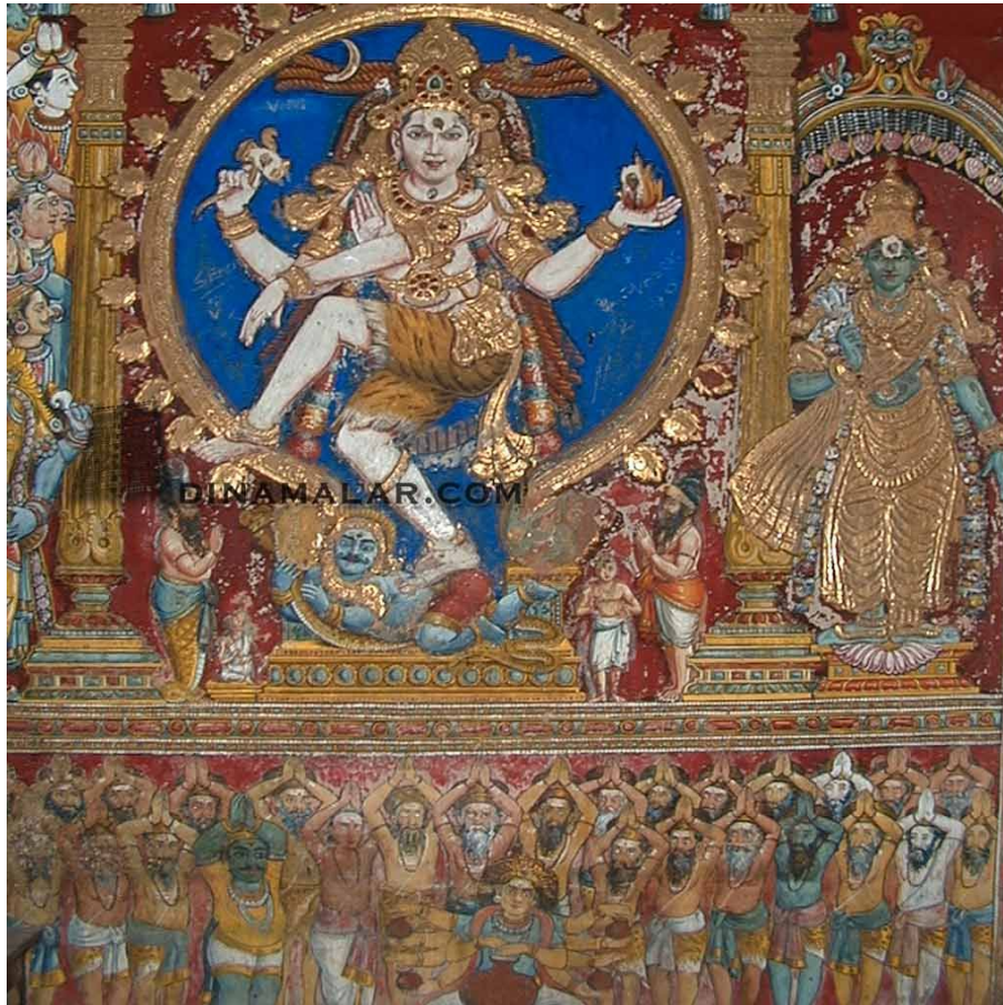
Lord Shaasta seated as Yogeeshwara in Kutralam, Tamilnadu