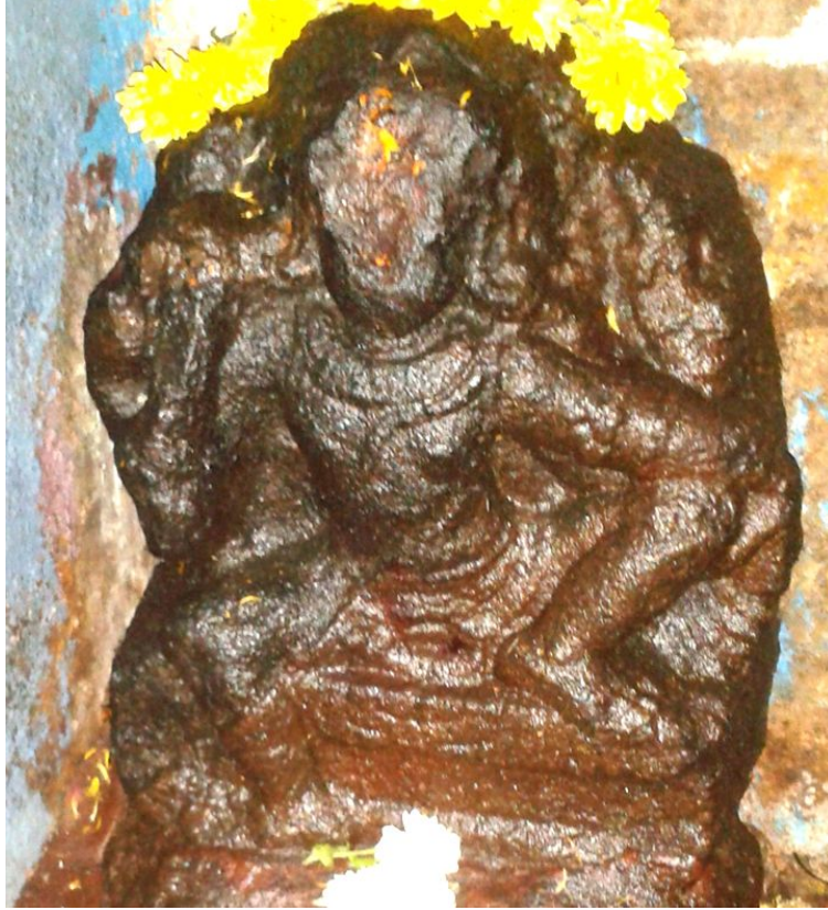
Lord Shaasta in Thiruvavarur