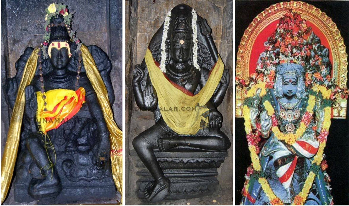
Dakshinamurthi in Cumbum, Thiruvaiyaru and Alangudi, Tamilnadu

In the famous temple of Thiruvaiyaru, Tamilnadu, one sees Dakshinamurthi with the Trishoola weapon - a clear Shaiva representation, while stamping on a tortoise.