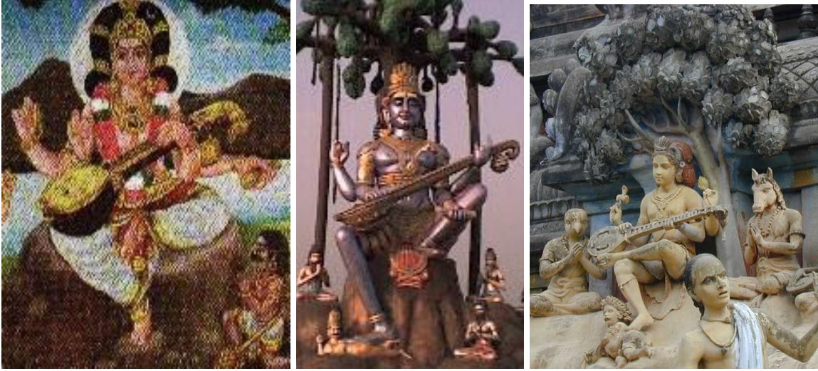
SriVidya Shaasta, Veena Dakshinamurthi and Kuthalam, Tamilnadu

One finds this representation in the temples of Kuthalam and Dharmapuram, Tamilnadu, while Sri Vidya Shaasta is enshrined in Verikarampalaiyam, Salem, Tamilnadu. One can see the form of Lord Sri Vidya Shaasta four-armed with the Veena, seated under the banyan tree holding a book, and facing south, along with consorts Poorna and Pushkala in the temple of Melapattam, in Palayamkottai part of Tirunelveli, Tamilnadu. This is a key intermediary stage between shaasta and Dakshinamurthi.