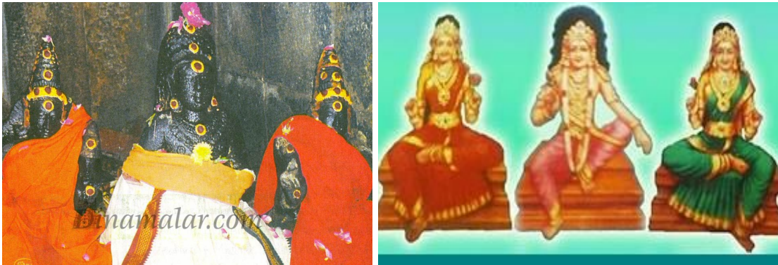
Lord Shaasta in Thirupattur, Palayamkottai

One also sees this form in Thirupattur, near Trichy, Tamilnadu, more than 1000 years old, which has sources such as the Periya Puraanam referring to the deity as “Saathanaar”. Similarly, the temple of Nadukkavudaiyar in Shanthinagar area of Palayamkottai, Tirunelveli has references in the Skanda Puraana as “Champakara Anya Goptha”.