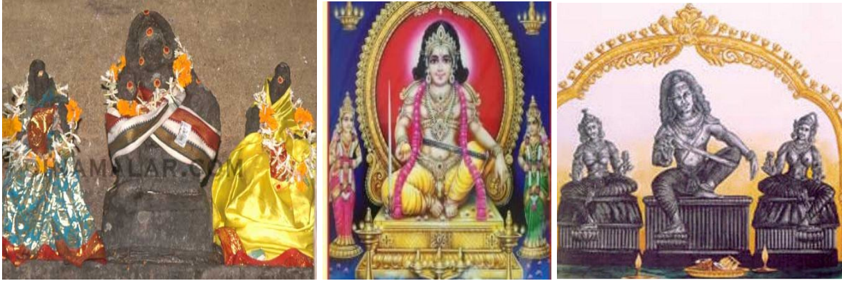
Lord Shaasta in Sori Muthaiyan Koil, Achankovil and Kanchipuram Kamakshi temple

This form denotes a transition from earlier Shaasta representation to a slightly less subtle level, with the two aspects of Jnaana and Bhakti represented as two consorts of the Lord. One finds this representation in many more temples, including the one installed by Lord Parashurama in Achankovil, Pathanamthitta, Kerala - another of the six Chakra Shaasta temples. One also finds the form in Kanchipuram Kamakshi Temple, a temple as the very center of Sri Vidya enshrining the Universal Mother as Kamakshi. This shrine is gigantic, at almost 6 feet tall, and worshipped popularly in the past as a local cult, along with the king Karikaala Chola, who won wars appeasing this deity.