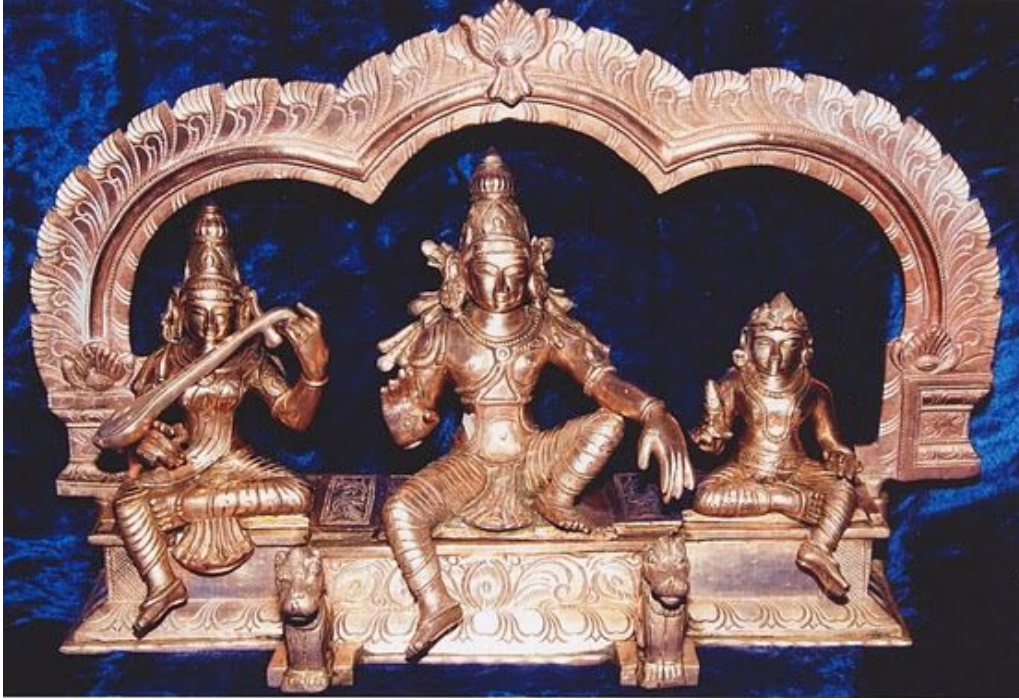
Lord Santhaana Pradha Shaasta with Prabha and Satyaka

powerful Kshetra of Thrikunnappuzha which is the first and foremost among 108 Kerala Shaasta Temples. This is also one of the forms extolled by Aadi Shankara.