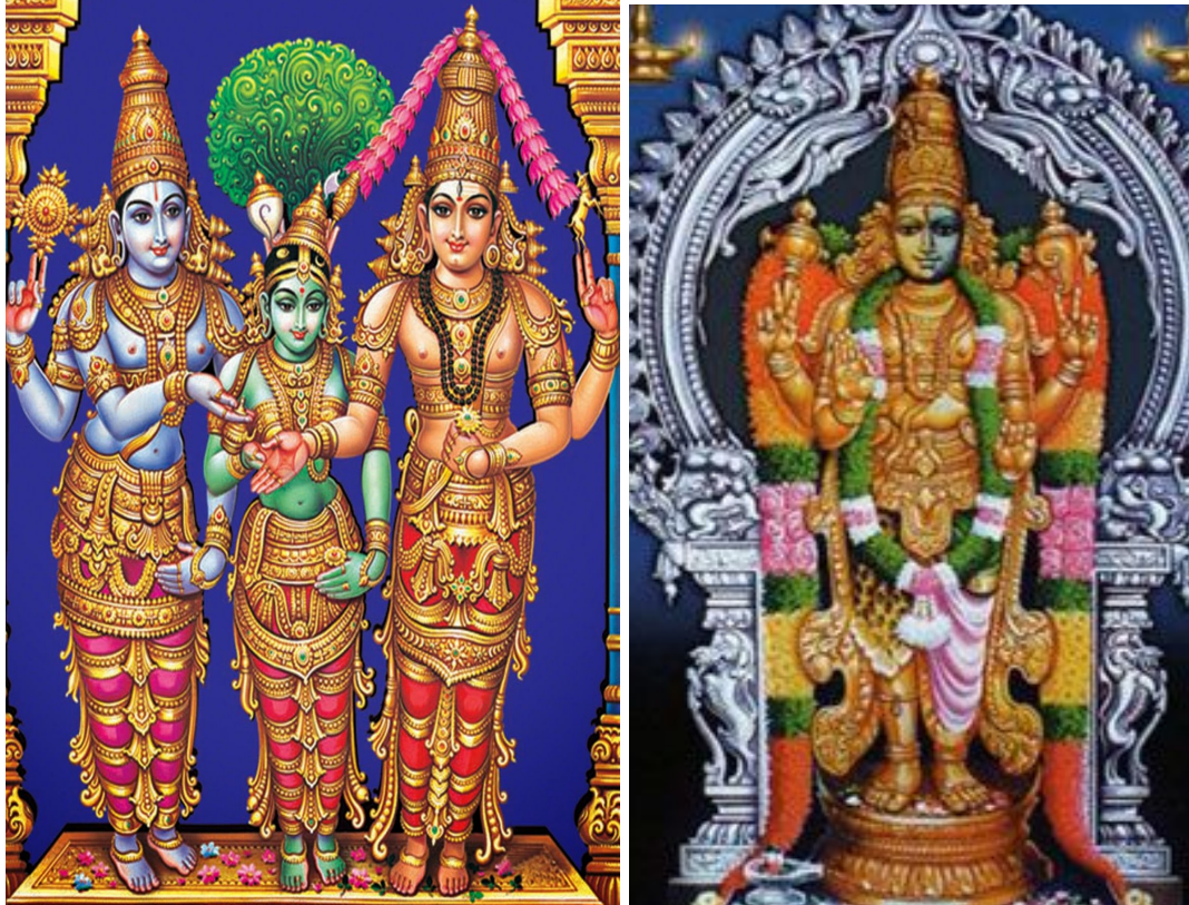
Maayon-Shakti-Shiva; ShankaraNarayana in Shankarankovil, Tamilnadu

Then comes an interesting stage, as an intermediate between Saguna and Nirguna. To do this, the vertical Saguna-Nirguna duality must assume a horizontal duality. For this, Maayon, along with Shiva and Shakti combine to form a single Saguna aspect, called 'Narayana', and this union takes the place of Shakti. This is the basis of associating Maaya, which is Maayon, as Yoga Maaya or Maha Maaya, the Goddess (Keralites often chant Amme Narayana). Nirguna on the other hand conflates taking the place of Shiva. At this point, Shiva, as Arunachala transcends form and emerges as a tall pillar of fire (The 'Formless Form' of Lingam), and is now called Shankara.