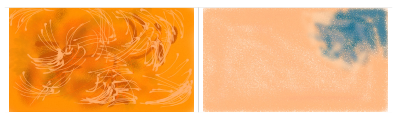
Fig. 1 Depictions of first hallucinations – orange 'fur' (left) morphed into diseased skin (right.)