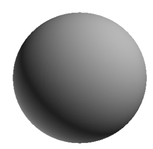
Figure 11: Two black holes of unit mass each, at a distance of 1.