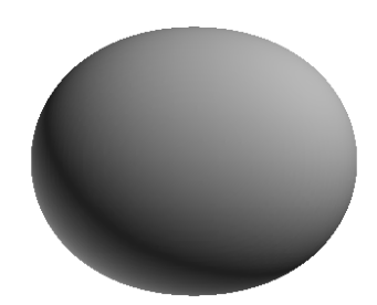
Figure 9: Two black holes of unit mass each, at a distance of 3.