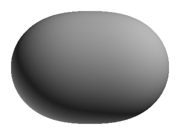
Figure 8: Two black holes of unit mass each, at a distance of 4.