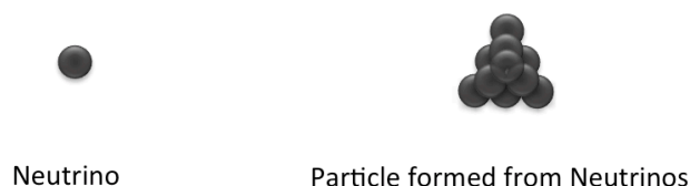
Fig. 1 – Particle Formation

In Particle Energy and Interaction: Explained and Derived by Wave Equations , an energy equation was proposed to calculate the mass of particles based on the number of neutrinos in the particle's core. 1 The concept is simple because it is based on a similar model of the atom and the construction of the nucleus. Nature repeats itself. Neutrinos, and their counterpart antineutrinos, combine in geometric formations to form particles such as Figure 1.