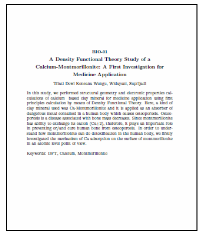
Figure 1. Illustration of BoA produced by mkboa.sh shell script: page title (left), table of contents (center), and an abstract page (right).