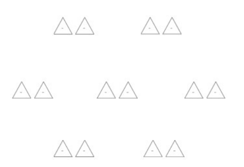
Figure 2: Ortho-hydrogen Lattice Crystal

Triangle form comes from the fact that proton consists of three electrons, so each corner presents an electron. Due to gravitational interaction, those triangles are "standing" on two bottom electrons. Plus (or minus) signs present spinning direction of those proton electrons, which is the same for all those three electrons. Minus means clockwise and plus counter clockwise, binding electrons are omitted.